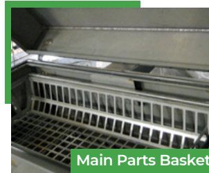
Main Parts Basket

This heated parts washer is easy to use and has automation features including PLC Programmable Wash Cycle Timer and Heater Timer. Rugged heavy gauge steel construction for durability and exceptional value for performance per labor hour improves the cost of operation . Renegade Parts Washers are designed to work with Renegade solvent-free detergents for maximum cleaning without residue buildup.