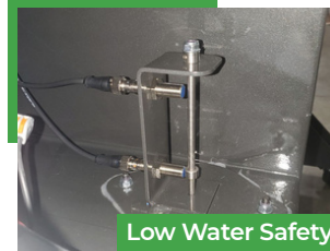
Low Water Safety