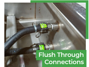
Flush Through Connections