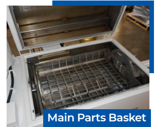
Main Parts Basket