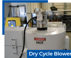
Dry Cycle Blower

Customize your system with a wide range of options for your production process cleaning. Performance benefits include larger capacities, increased automation and integration of components. Renegade engineers and sales representatives listen to your special cleaning challenges to meet your clean specification or stringent warranty requirements. Maximize efficiency with Renegade custom designed parts washer systems for your production cell cleaning operation.