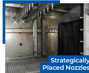
Strategically Placed Nozzles

Industry 4.0 Compatible: This Renegade I-Series system is Industry 4.0 compatible meaning it can be connected to real-time monitoring, predictive maintenance, and customizable interfaces, making cleaning systems smarter, more efficient, and cost-effective.