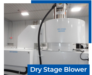
Dry Stage Blower