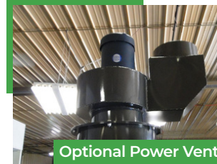
Optional Power Vent