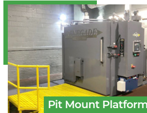
Pit Mount Platform