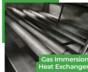
Gas Immersion Heat Exchanger

Automation features include automatic low water level shutdown, 7-day programmable wash timer and PLC programmable wash cycle timer. Renegade Aqueous Parts Washers are designed to work with Renegade detergents for maximum cleaning without residue buildup.