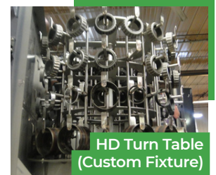
HD Turn Table (Custom Fixture)