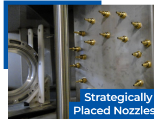
Strategically Placed Nozzles