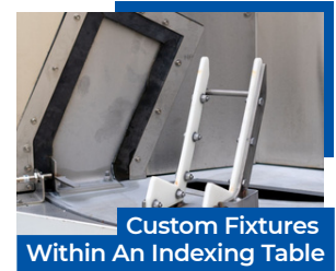
Custom Fixtures Within An Indexing Table