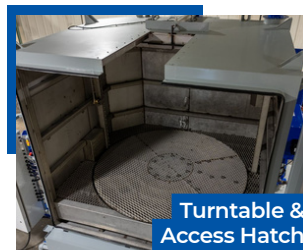
Turntable & Access Hatch

Renegade engineers collaborate with you to address your unique cleaning challenges, custom designing a system that meets or exceeds your cleanliness specifications. Additional custom fixtures ensure maximum cleaning repeatability. For optimal results, pair with Renegade Solvent-Free detergents to achieve a superior clean without residue buildup or environmental hazards.