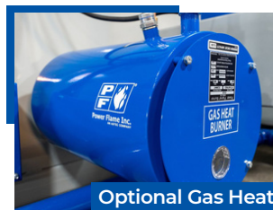
Optional Gas Heat