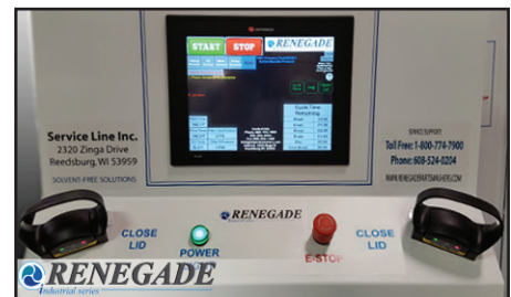
Control Station with Dual Zero Force Touch Buttons