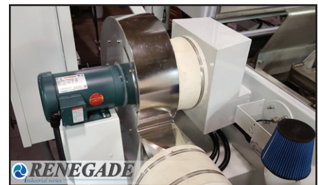
Dry Cycle Blower