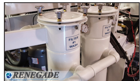
Wash Cycle and Rinse Cycle Filtration System