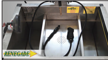
Sink Wash Zone