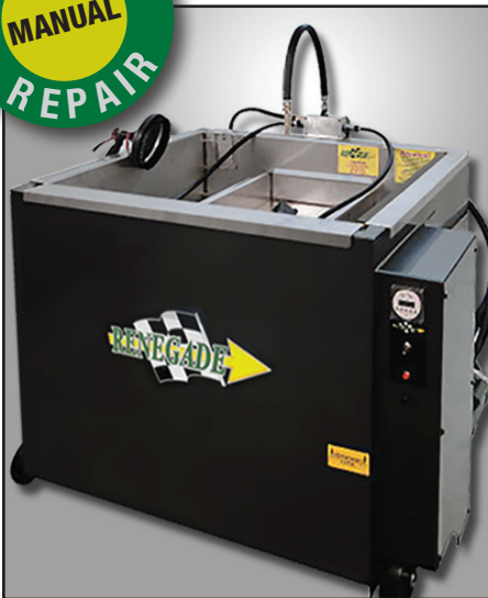
TMB 5000 Outside Dimensions Height: 54-1/2 inches; Width: 43 inches; Depth: 31 inches