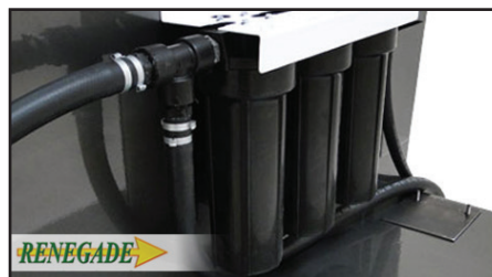
Triple Filtration System