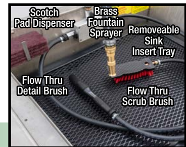
Sink Wash Zone