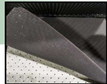
Removeable Sink Insert Tray with Foam Splash Insert and Oil Towel