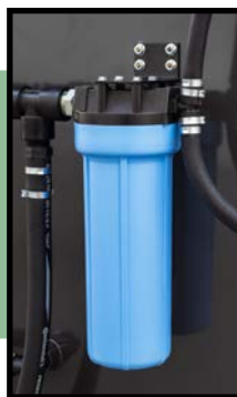
Cartridge Filtration System