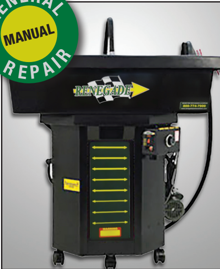
TMB 3000 Outside Dimensions Height: 40-1/2 inches; Width: 40-1/2 inches; Depth: 31 inches