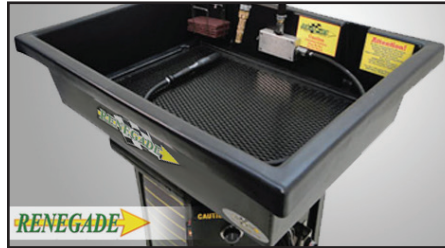
Sink Wash Zone