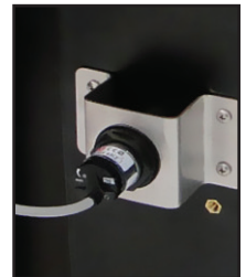
Low Water Alarm