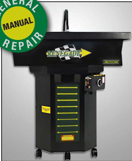
TMB 2000 Outside Dimensions Height: 40-1/2 inches; Width: 40-1/2 inches; Depth: 31 inches