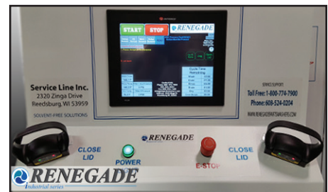
Control Station with Dual Zero Force Touch Buttons