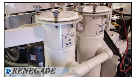
Wash Cycle and Rinse Cycle Filtration System