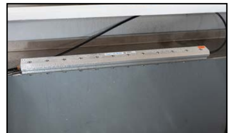
24" air knife blows excess water from parts