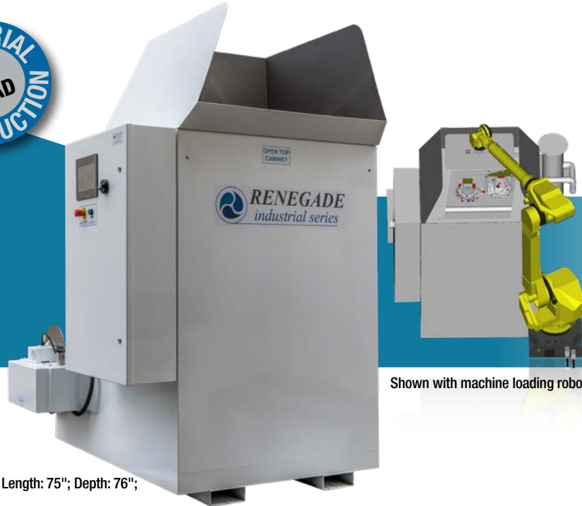
Shown with machine loading robot.

Dimensions: Length: 75"; Depth: 76"; Height: 96".