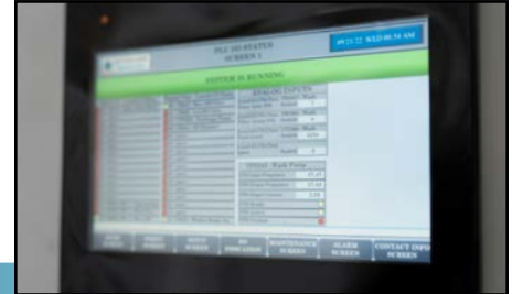
Large, user-friendly HMI/PLC Control Panel