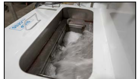
Debris trays catching debris above the water level

The Renegade I-Series Top Load Spray Off Cabinet Washer is an in-cell, part robotically held washer for industrial mid-machining processes. This quick wash is designed to handle high production rates for cleaning off heavy chip, heavy coolant containments. A robotic arm is required and parts lowered into the cabinet for cleaning while still gripped by the robot. Wash and dry cycles are determined via communication with the robotic arm and facility's communication system. Multiple spray manifold configurations for strategically washing with variable nozzle pressures from 1-40 psi. The blow off stage compartment contains a powerful air knife to remove trapped or pocketed water.