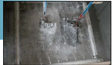
Precisely positioned nozzles and spray manifolds deliver high volume force for maximum cleaning