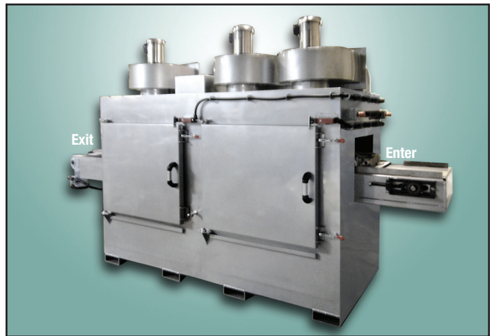
Renegade I-Series Pass Through Parts Dryer Dimensions: Length: 142"; Height: 91" inches; Width: 63" inches.