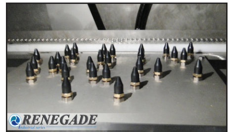
Strategically-placed compressed air nozzles remove residual water from hard to reach cavities.