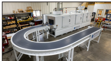
Renegade Pass Through Parts Washer shown with External Conveyor.