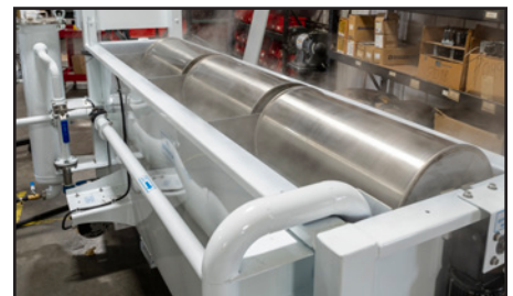
Optional baffled three-chamber rotating drum oil separator filtration system.

I-SERIES 4824 MULTI-STAGE PASS THROUGH PARTS WASHER Rev. 01-2023 Cycle times will vary depending on production cell operations, part size, part shape, part weight, and product supply. Subject to changes and modifications without notice.