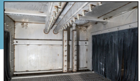
Precisely positioned nozzles and spray manifolds deliver high volume force for maximum cleaning. Dry chamber air knife blows excess water from parts.