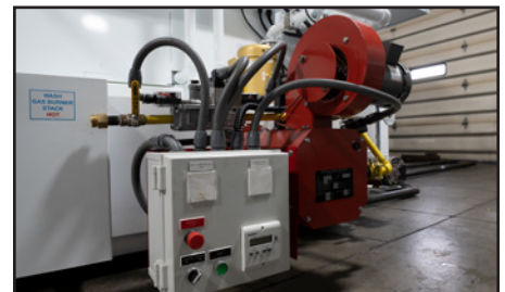
Gas heated wash, rinse and dry stages.