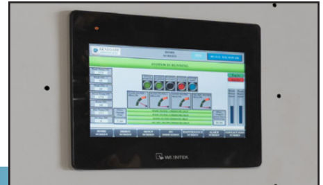
Large, user-friendly HMI/PLC Control Panel