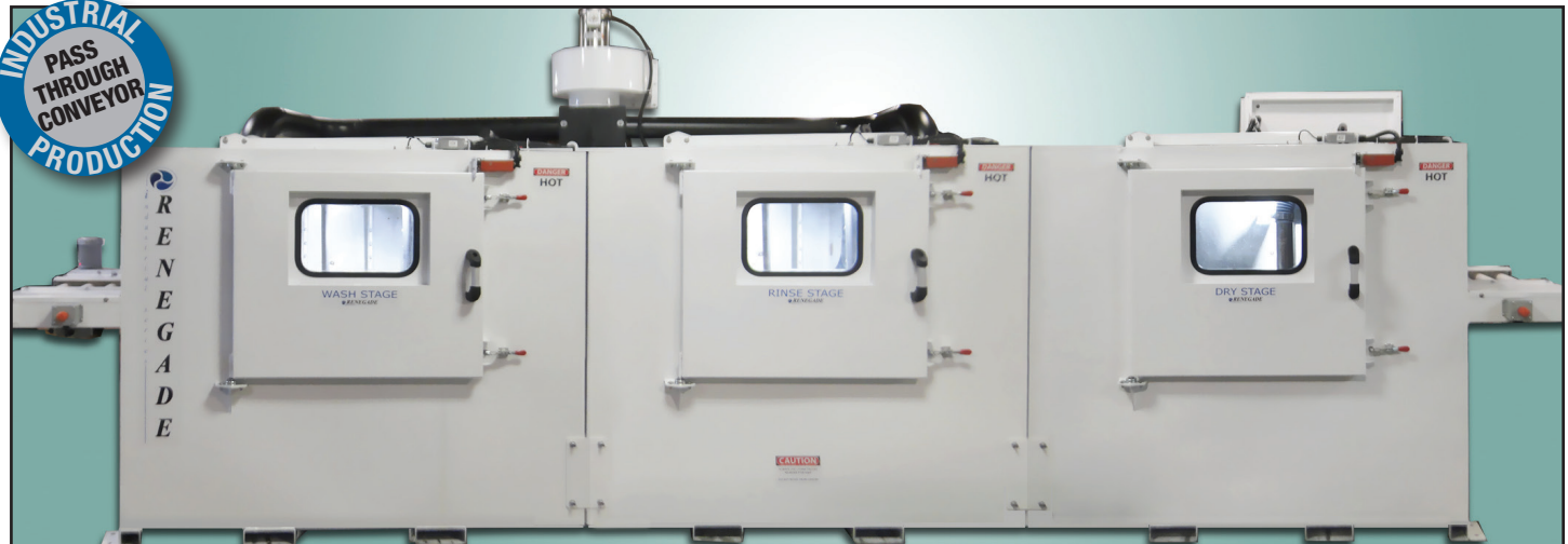
Renegade I-Series Multiple Stage Pass Through Washer WRD Dimensions: Height: 106 inches; Width: 253 inches; Depth: 119 inches