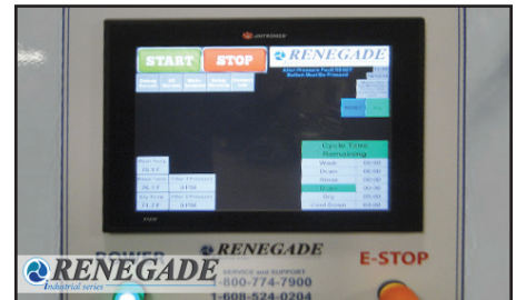
Large, user-friendly HMI/PLC Control Panel