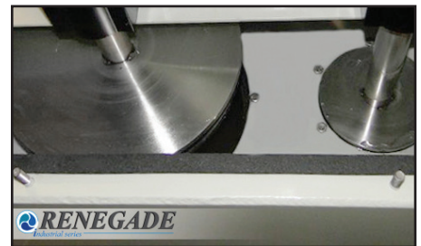
Closed Loop Wash Rinse Cycle - Pneumatic Actuator