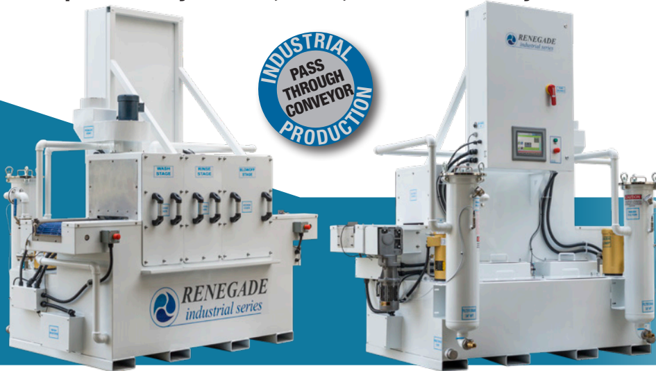
Renegade I-Series Compact WRD Pass-Through Parts Washer. Shown with Acetal Plastic belt conveyor. Dimensions: Length: 96"; Height: 102"; Depth: 67".

The Renegade I-Series Compact Wash, Rinse Blow-Off Pass-Through Parts Washer features a small footprint and delivers 3-stage continuous operation to clean and dry complex, multi-ported parts transported via conveyor operation. Each wash and rinse stage compartment contains spray manifolds with strategically-placed nozzles to deliver high pressure force and high temperature cleaning. The blow off stage compartment contains a powerful air knife and/or blower to remove residual water from even hard to reach cavities. Conveyor "tunnel" or "pass-through" parts washers are designed for high production, repetitive cleaning operations. Stages can be configured in any order. The Renegade Modular Conveyorized Cleaning System reduces labor and increases operational efficiency for real impact on your cost of operation.