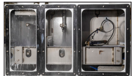
Precisely positioned nozzles and spray manifolds deliver high volume force for maximum cleaning. Dry chamber air knife blows excess water from parts.