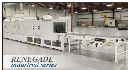
Renegade Pass Through Parts Washer shown with External Conveyor.