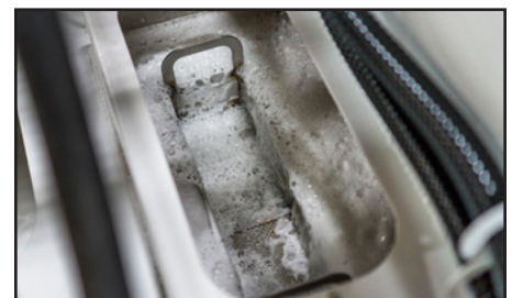
Debris trays catching debris above the water level

I-SERIES COMPACT WRD SS PASS THROUGH PARTS WASHER Rev. 08-2021 Cycle times will vary depending on production cell operations, part size, part shape, part weight, and product supply. Subject to changes and modifications without notice.