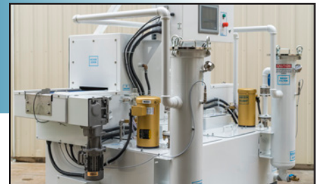
Filter assemblies and 3 HP heavy duty pumps for wash and rinse cycles