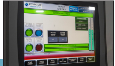
Large, user-friendly HMI/PLC Control Panel