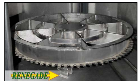
Heavy Duty Gear-Driven Turntable Assembly