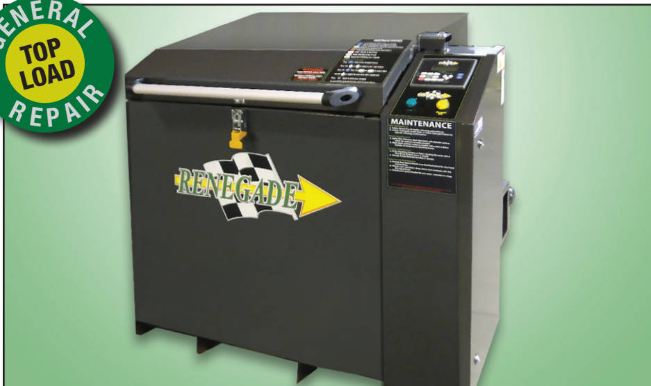
TMB 2614 Dimensions Height: 45" inches; Width: 44-1/2" inches; Depth: 51-1/2" inches