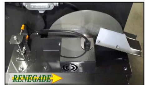
Oil Skimmer and Low Water Safety