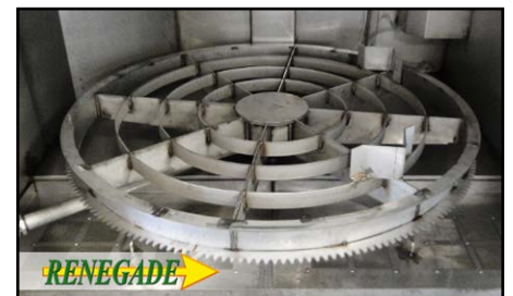
Heavy Duty Gear-Driven Turntable Assembly