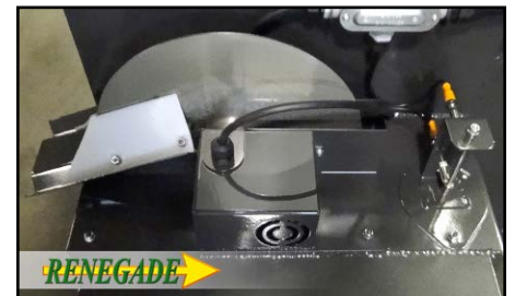
Oil Skimmer and Low Water Safety