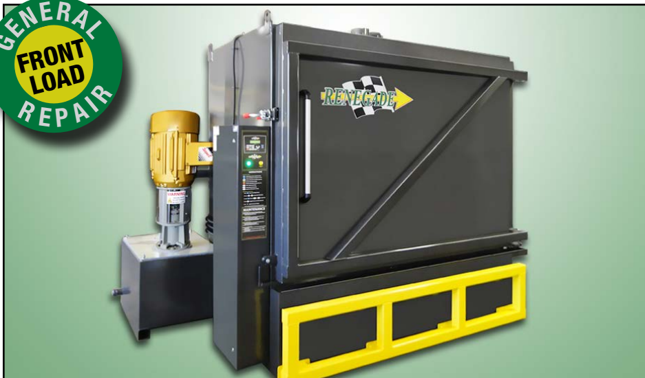
FL 9000 7048 Dimensions Height: 111 inches; Width: 127 inches; Depth: 88.5 inches. (Shown with heavy-duty fork truck guard option.)