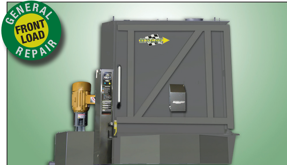
FL 9000 6048 Dimensions Height: 102.5 inches; Width: 111.5 inches; Depth: 83.5 inches

Renegade Model FL 9000 6048 with 30 HP Wash Cycle Pump and 360 Gallon Sump Capacity