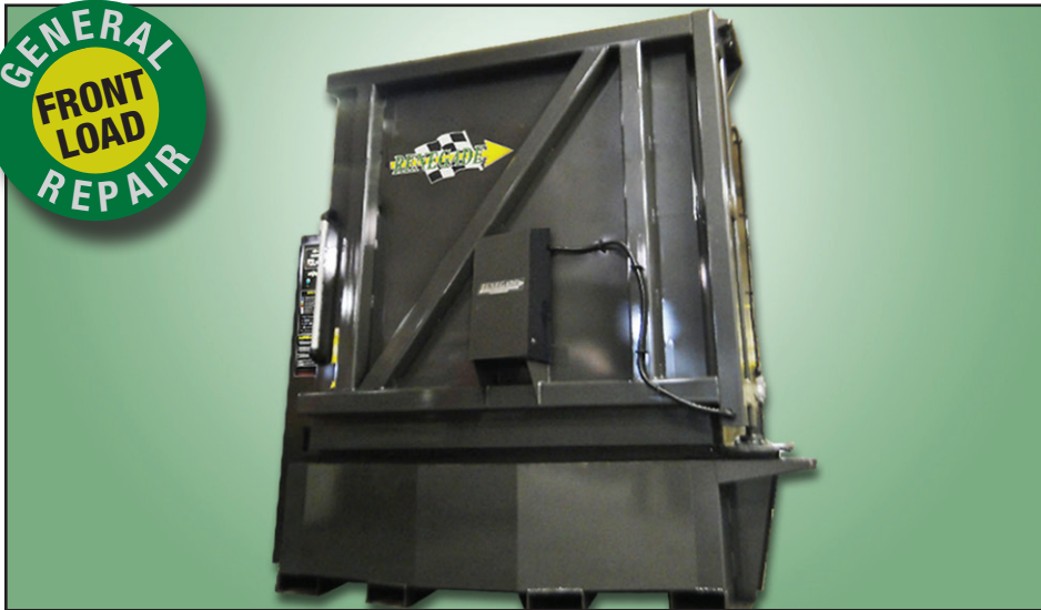
FL 9000 6048 Dimensions Height: 102.5 inches; Width: 111.5 inches; Depth: 83.5 inches