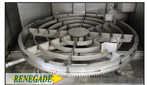
Heavy Duty Gear-Driven Turntable Assembly