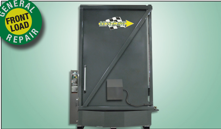
FL 9000 60102 Dimensions Height: 148.5 inches; Width: 100.25 inches; Depth: 90.5 inches