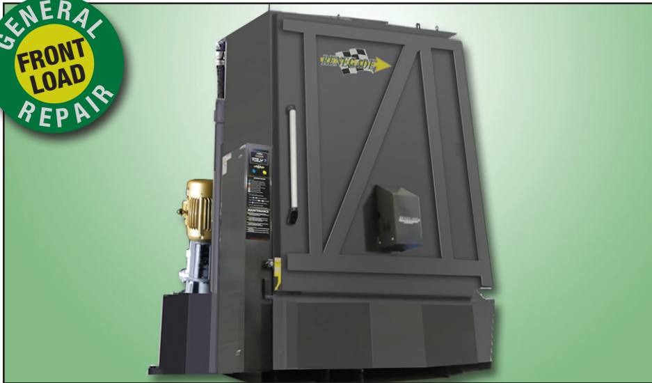
FL 9000 5060 Dimensions Height: 111.5 inches; Width: 107 inches; Depth: 73.5 inches