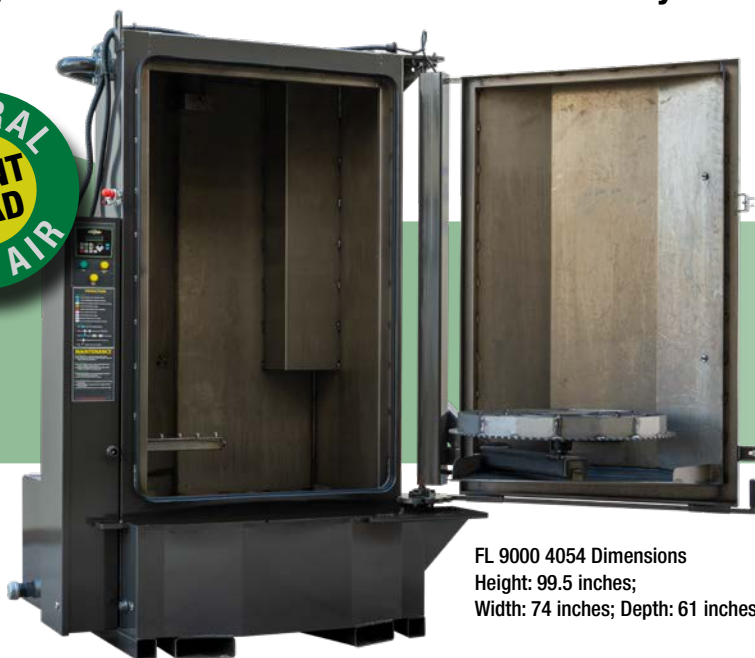
FL 9000 4054 Dimensions Height: 99.5 inches; Width: 74 inches; Depth: 61 inches