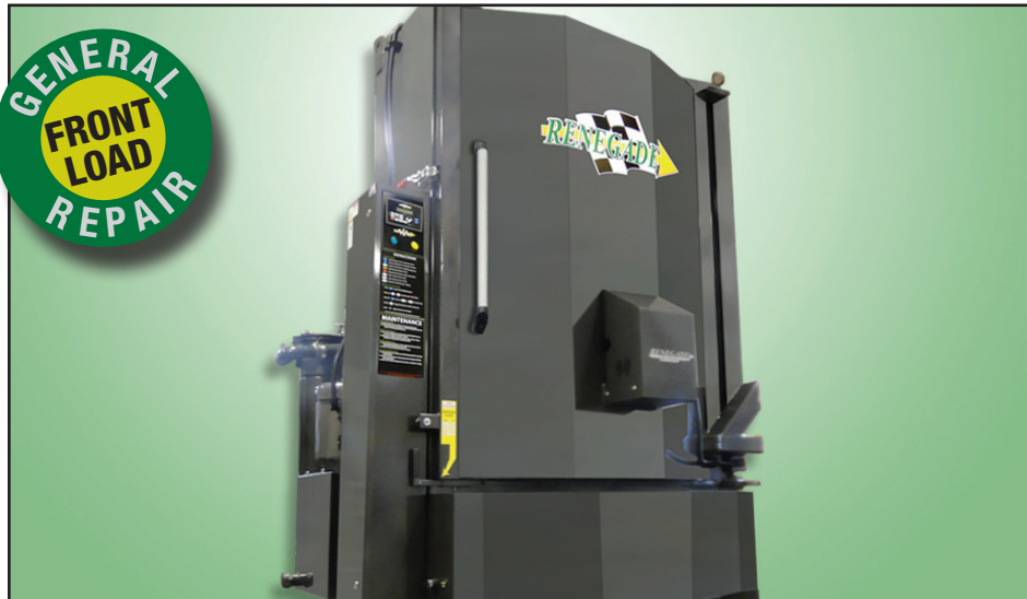
FL 9000 4054 Dimensions Height: 99.5 inches; Width: 74 inches; Depth: 61 inches

Renegade Model FL 9000 4054 with 7.5 HP Wash Cycle Pump and 190 Gallon Sump Capacity