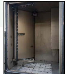
Heavy-Duty Spray Manifold