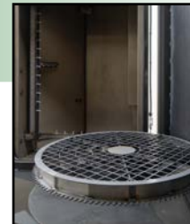
Heavy-Duty, Door Mounted, Gear Driven Turntable