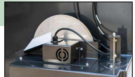
Oil Skimmer and Low Water Safety