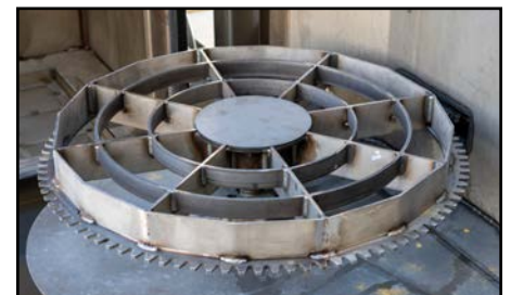
Heavy Duty Gear-Driven Turntable Assembly