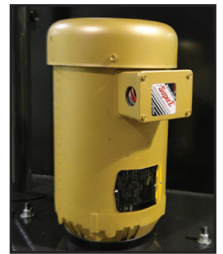
High Efficiency Pump Motor