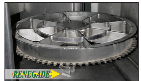
Heavy Duty Gear-Driven Turntable Assembly