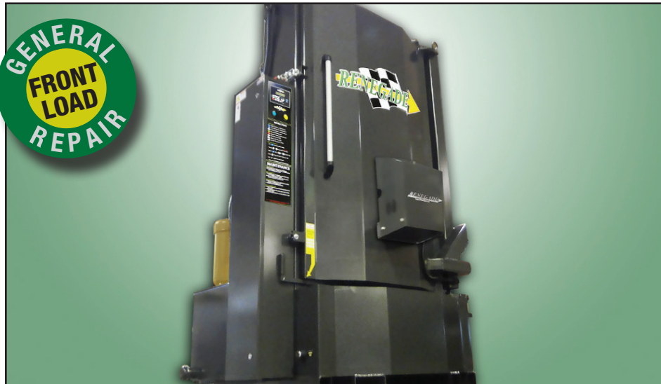
FL 9000 3048 Dimensions Height: 93.5 inches; Width: 64 inches; Depth: 50 inches.

Renegade Model FL 9000 3048 with 5 HP Wash Cycle Pump and 100 Gallon Sump Capacity