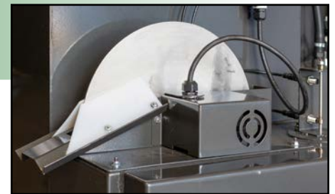
Oil Skimmer and Low Water Safety