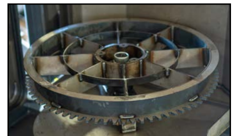
Heavy Duty Gear-Driven Turntable Assembly. Door-Mounted for Easy Load Access.