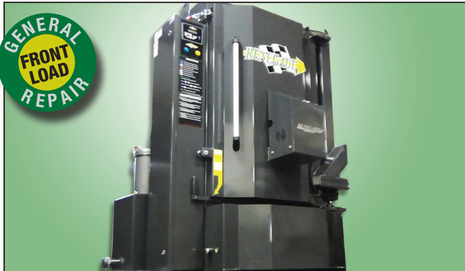
FL 9000 2633 Dimensions Height: 75 inches; Width: 60.5 inches; Depth: 51.5 inches

Renegade Model FL 9000 2633 with 3 HP Wash Cycle Pump and 75 Gallon Sump Capacity