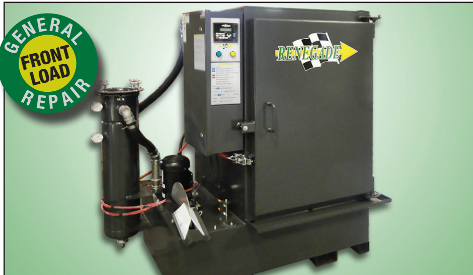
FL 8500 2836 Dimensions Height: 67.5 inches; Width: 58 inches; Depth: 39 inches

Renegade Model FL 8500 2836 with 3 HP Wash Cycle Pump and 60 Gallon Sump Capacity