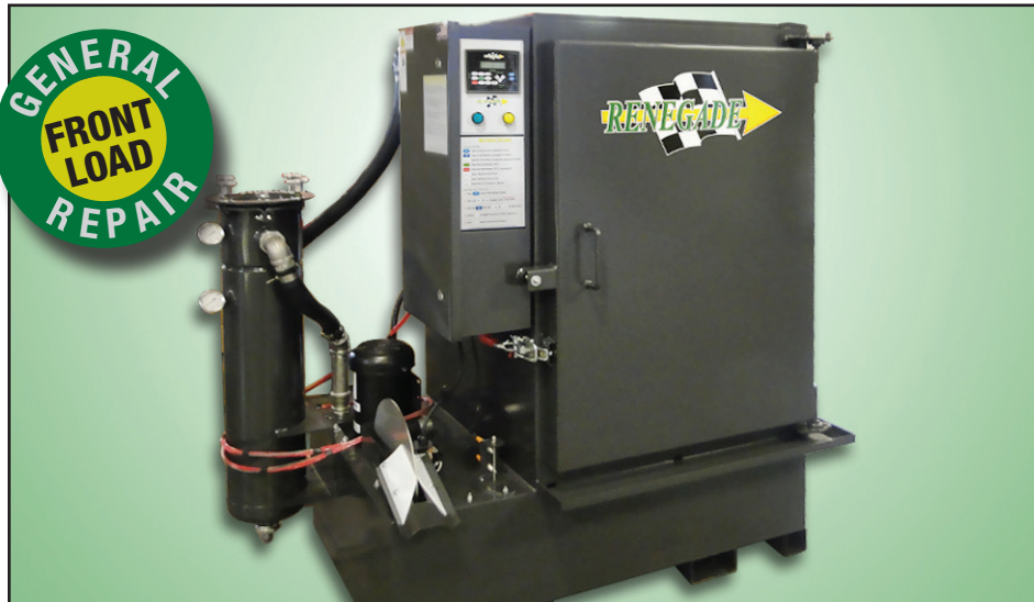
FL 8500 2836 Dimensions Height: 64.5 inches; Width: 58 inches; Depth: 39 inches

Renegade Model FL 8500 2836 with 3 HP Wash Cycle Pump and 60 Gallon Sump Capacity