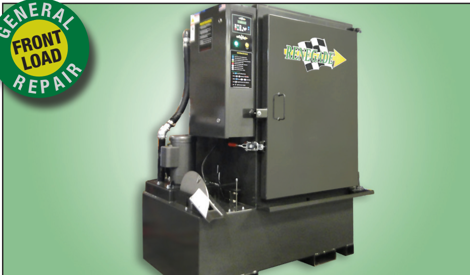
FL 8500 2836 Dimensions Height: 67.5 inches; Width: 58 inches; Depth: 39 inches