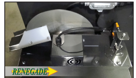
Oil Skimmer and Low Water Safety