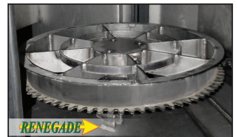
Heavy Duty Gear-Driven Turntable Assembly