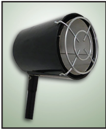
Work Light for Manual Parts Washers