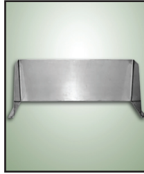
Splash Shield for Manual Parts Washers